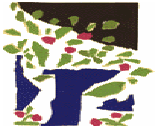
XXII IASP Congress September 2003 Stockholm, Sweden

Contact IASP Congress www.ki.se/suicid/iasp2003